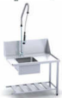
Table combination consisting of: 1150 mm feed table (left or right) incl. basket skid, tank, tank filter, rinsing spray, splash guard and floor grid (removable) and 700 mm discharge table (left or right) with basket skid and floor grid (removable) Complete price